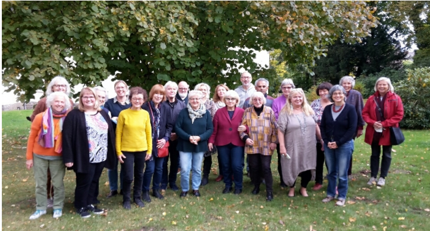
Annual C.I.F.-meeting, October 16, 2021