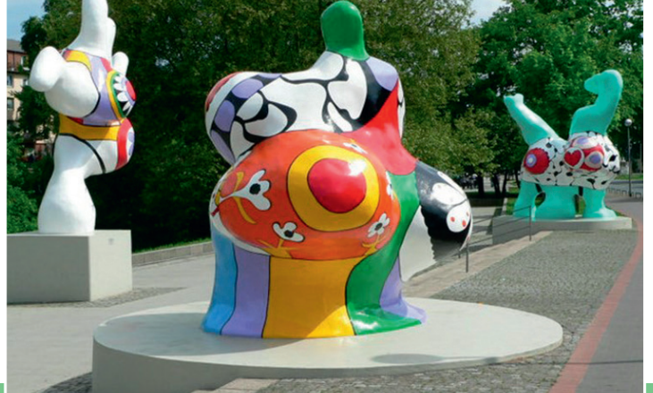
The Three Nanas of Niki de Saint Phalle