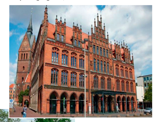
The Old Town Hall