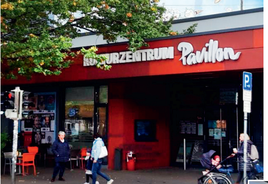
Main entrance of the Kulturzentrum "Pavillon", our CIF-conference-site of 2023 at Hannover City

Inside the lobby of Kulturzentrum "Pavillon"