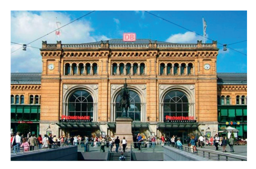
Main entrance of the Main Station, Hannover

The artist Niki de Saint Phalle was made an honorary citizen of Hannover in 2000. 300 of her works can be seen in the Sprengel Museum Hannover.