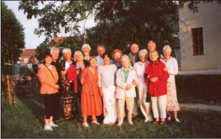
'The 1957 CIP Group'

Almost 50 years ago 51 people from 8 European countries met in Cleveland/Ohio, all of them participants in the 1957 CIP. After their return home they tried to keep