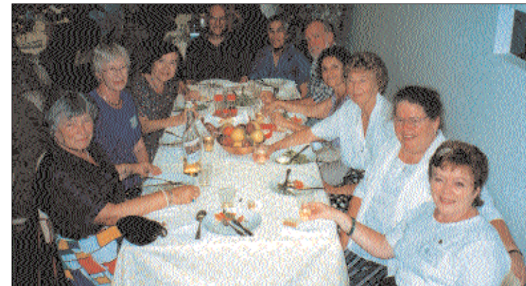
Participants of CIP 1963 Cleveland Program mat at the 2001 Conference in Italy.