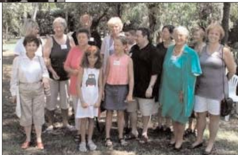
Dutch Participants at the 2001 Conference

several new acquaintances and friendships.