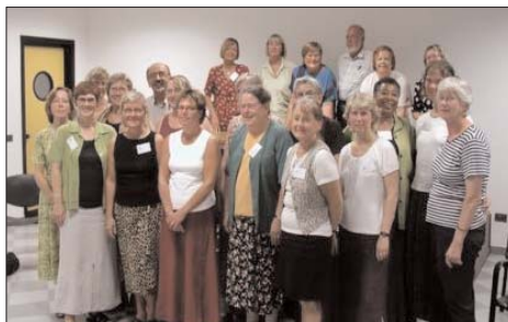
Swedish Participants at the 2001 Conference

The Board of Directors meetings and Executive Committee election were special experiences for me. I can't forget the nice musical events which provided a special atmosphere and gave a chance for making