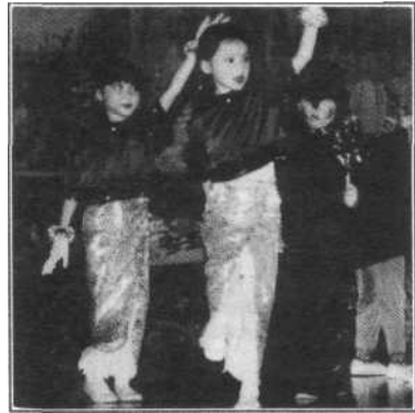
Children's activities play an important part in the PWS programmes.

In its service provisions it works in close co-operation with government ministries, such as the Ministry of Community Development, Ministry of Health and the National Council of Social Service for funding of its programmes. Other avenues of financial support comes from well-wishers, corporate as well as individuals.