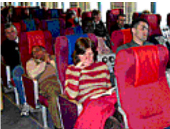
Participants take the opportunity to rest during a ferry trip

Most of the accommodation will be in host families. This gives a unique opportunity to get to know Sweden from breakfast to evening coffee – from everyday duties to celebrations.