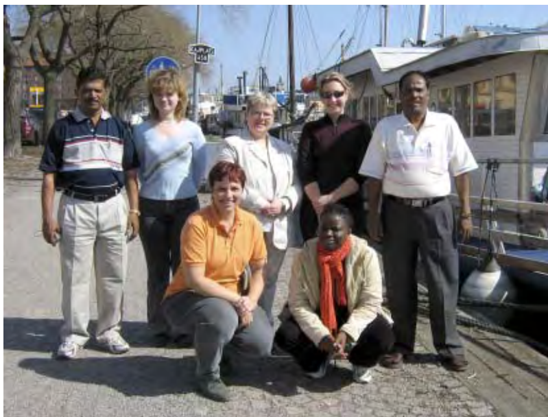
Participants in Sweden 2006